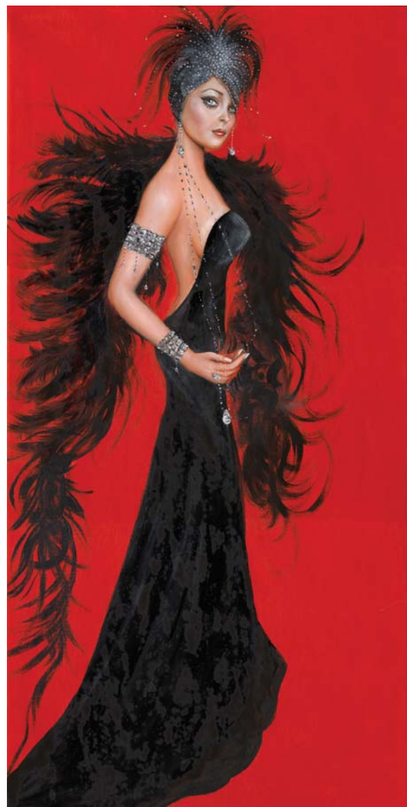
DIAMONDS ARE..., OIL ON CANVAS, 48 x 24"