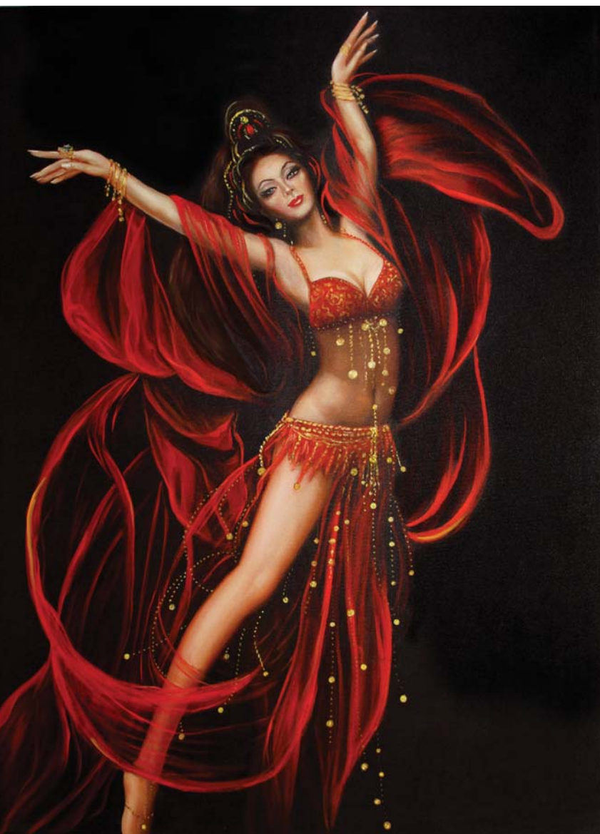
ALEXANDRIA, OIL ON CANVAS, 48 x 36"